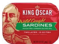
King Oscar Brisling Sardines in Extra Virgin Olive Oil Can, 3.75oz