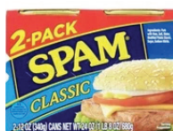
Spam Classic Can, 12oz, 2ct