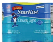
StarKist Chunk Light Tuna in Water Can, 5oz, 8ct