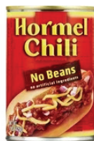
Hormel Chili, No Beans, No Artificial Ingredients, 15oz