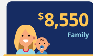
2025 IRS HSA contribution limits

If you're over 55, you can make catch-up contributions of $1,000 annually.