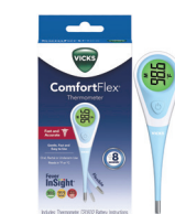
Vicks ComfortFlex Oral Digital Thermometer