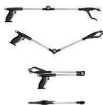
Equate Folding Reaching Tool, 32"