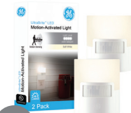
General Electric UltraBrite LED Motion-Activated Night Light, Dusk to Dawn