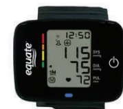
Equate Wrist Blood Pressure Monitor, 4500 Series*