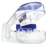
Equate Ultra Pill Splitter and Pill Cutter with Retracting Blade Guard