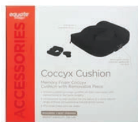
Equate Memory Foam Coccyx Cushion, Black