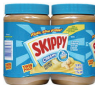
SKIPPY Creamy Peanut Butter Spread, 40oz, 2ct